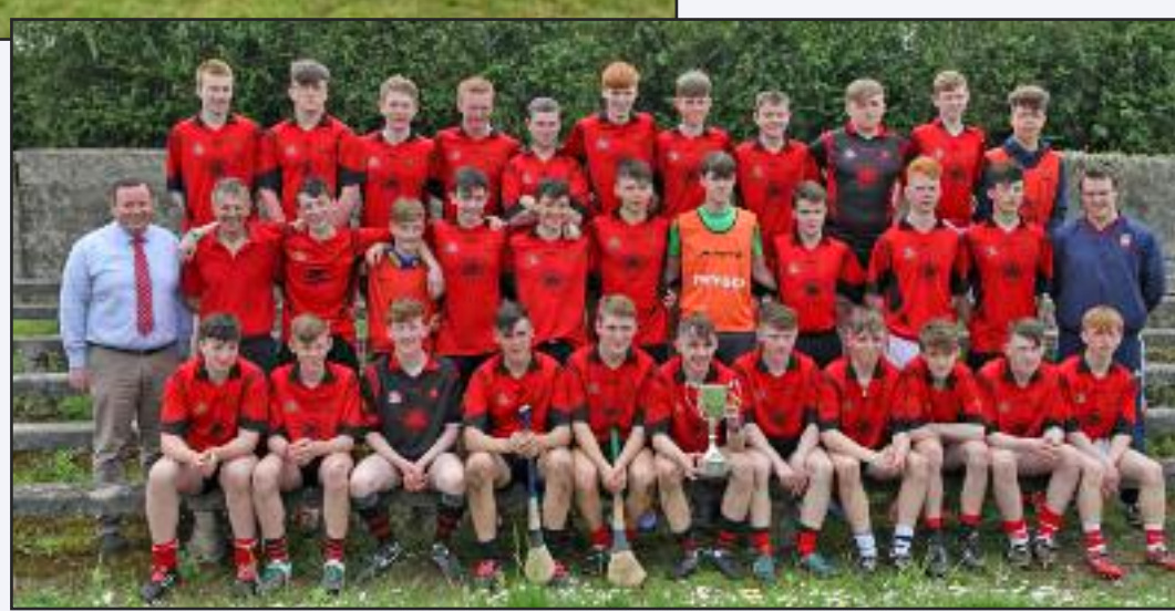
U17 Hurling Team who won the O'Leary Cup 2016

Junior Camogie Munster Final winners of the Sr. Patricia Cup 2016