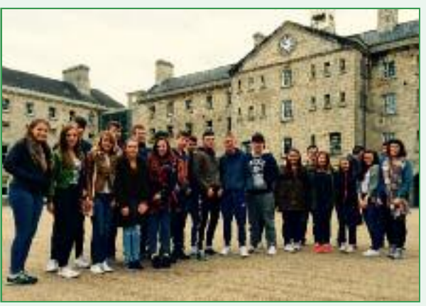
5th Yr History National Museum