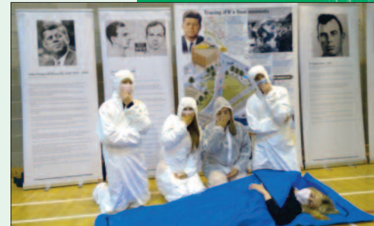
TY Forensics Workshop