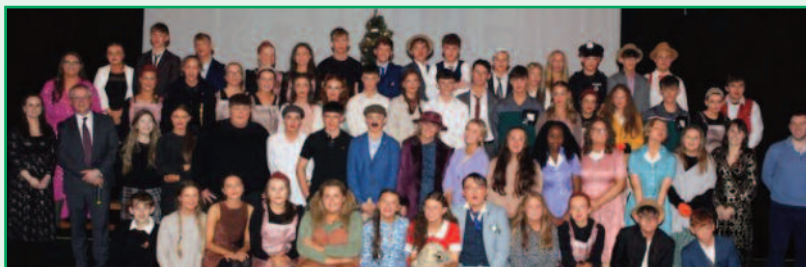
Cast of "Annie" Coláiste Phobal Ros Cré TY Musikcal 2023