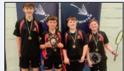
Girls & Boys Badminton