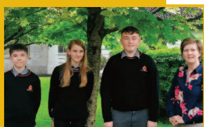
Centre for Talented Youth