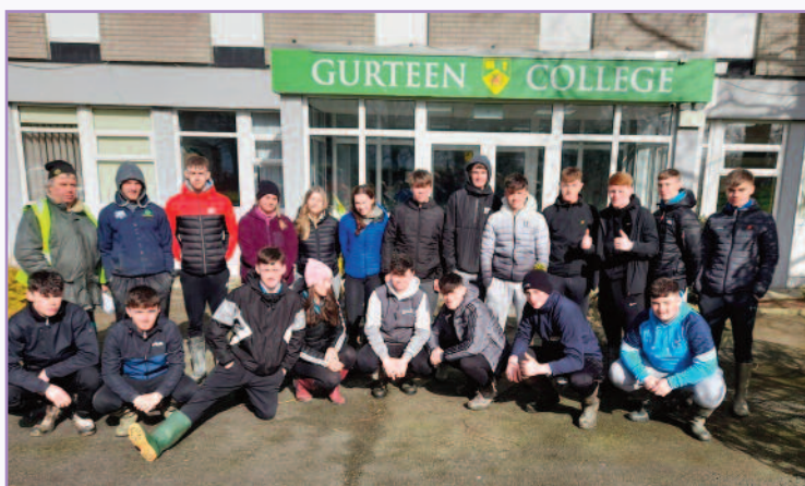
Ag Sc Gurteen Agricultural Visit