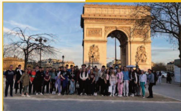
Paris Trip 2024

Hurling, Golf, Football, Rugby, Drama & Quiz, Athletics, Soccer, Basketball, Equestrian, Music and Badminton.