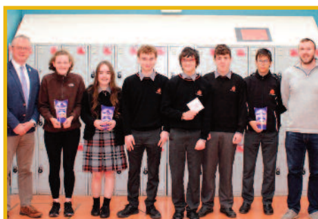
Talent Show winners