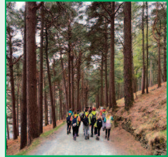
TY Glendalough Hike