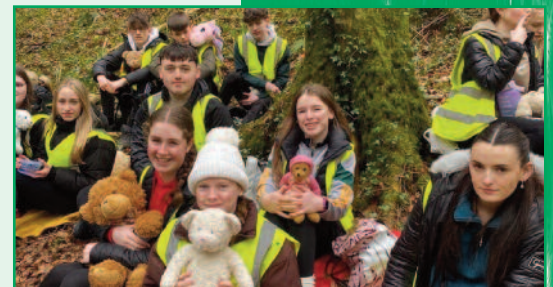
TY Students enjoy Teddy Bears Picnic