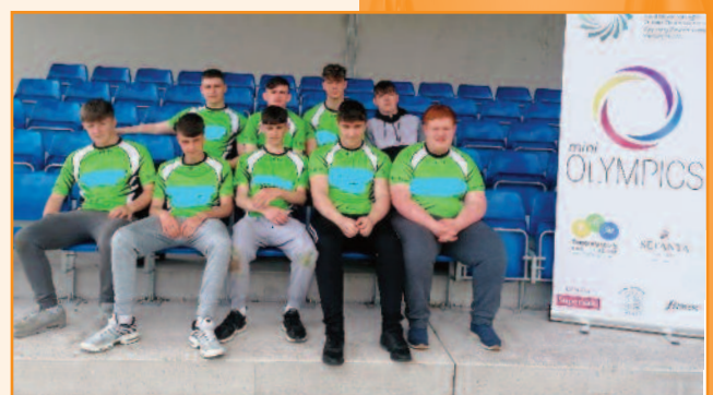
ETB Mini Olympics