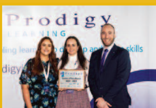
Prodigy Learning Centre of Excellence Award