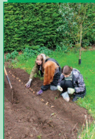
Planting for Climate week

In recent years Coláiste Phobal Ros Cré has embraced the Green School initiative. A number of staff and pupils have formed an active committee which has worked hard at ways of improving our school environment. Planting of trees and landscaping has commenced as has the construction of a new water management depot. In the coming year conservation measures and cleanups will be high on the agenda as we seek full green school flag status.