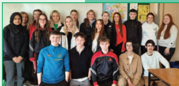
L'échange Scolaire Entre la France et L'Irlande