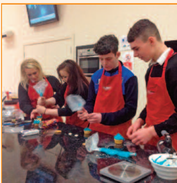
Recipe for success!

Involves Social Education, Arts, Modern Languages, Irish, Leisure and Recreation.