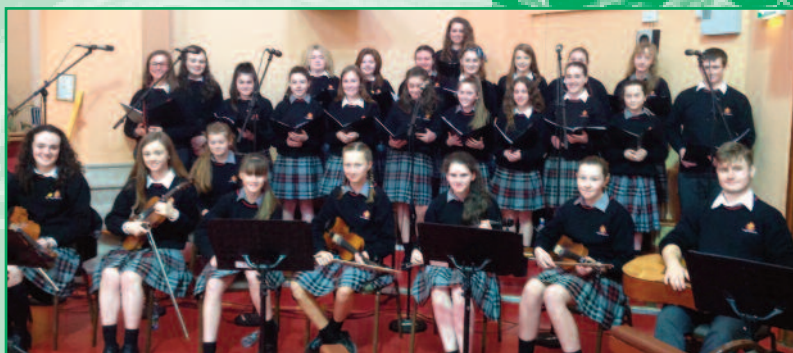
School choir and musicians