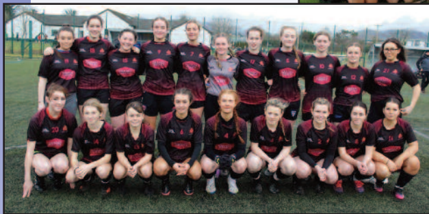
Senior Girls Soccer Leinster A Champions 2022/23