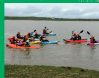
TY at outdoor pursuits for Gaisce Award in Belmullet and at Erris Head