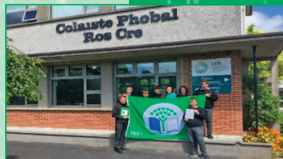
5th Green Flag 2022

Instruments such as guitars and flutes can be rented from the school. Guitar, piano, flute and bodhran classes are available after school hours.