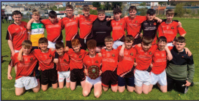
Rice Cup Hurling