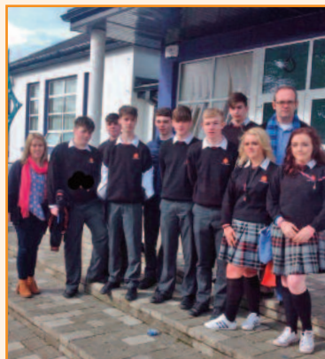
LCA Trip to Templemore College