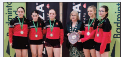
All Ireland U16 Champions 2024