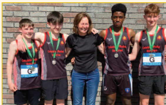
Silver Medalists in the Minor Boys All Ireland Relay Final 2024

Sport plays an important role in the lives of Coláiste Phobal Ros Cré students. Every effort is made to introduce students to as many sport and leisure activities as possible. As students progress through the school, they gain an appreciation of sport and the many benefits it brings to their lives. While the emphasis is on participation, there is also a competitive side to sport, which brings its own highs and lows. Over the years, our students, boys and girls, have achieved great sporting successes, with All-Ireland wins in hurling, camogie and badminton, as well as individual successes in the world of Athletics. Win or lose, we aim to be the best that we can be. With three Physical Education teachers and extensive new facilities, we now have the resources to continue this great tradition. The full sized gymnasium is equipped to the most modern standards and facilitates an advanced Physical Education programme. It also provides a much needed recreational facility for the town of Roscrea. The ball wall is in constant use and helps our students refine their skills.