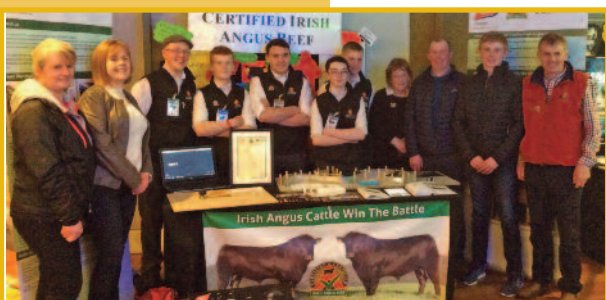
Angus Beef Competition